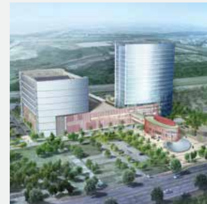
Piller DRUPS and unique Isolated Parallel Bus solution, Hana Bank.