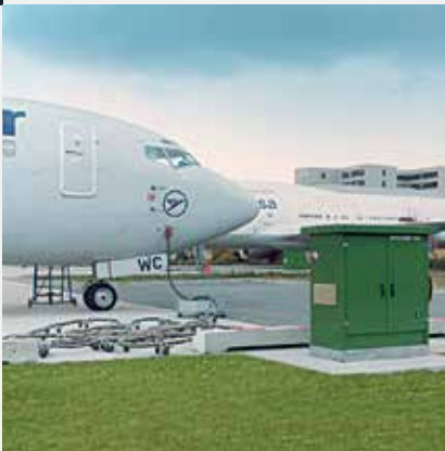
Piller gate boxes provide ground power at many international airports.

For over 40 years, Piller has been protecting military and civil applications, providing power systems to airports as well as shore-to-ship and on-board power systems for both submarine and surface vessels.