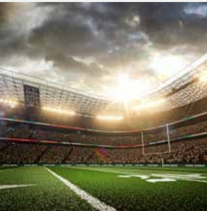
Containerised UPS solutions provide peace of mind at global sporting events.

Broadcasting and electronic communications are more a part of everyday life than ever before. As a result, power interruptions have more serious consequences than ever before.