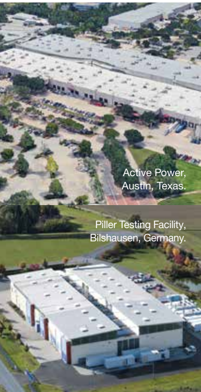
Active Power, Austin, Texas.

With over 7000 kinetic energy storage devices and more than 6000 rotary UPS units up to 3000kVA installed, Piller has around 300 technicians taking care of clients in more than 40 countries.