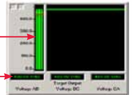
Three phases shown graphically and numerically