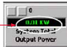
This value changes color based on its condition (green, yellow, red)